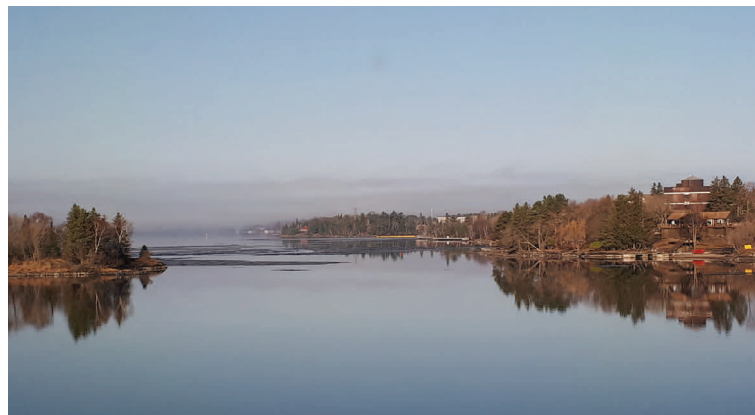
A BIT OF MIST HOVERS OVER THE LAKE ON MAY 3, 2018